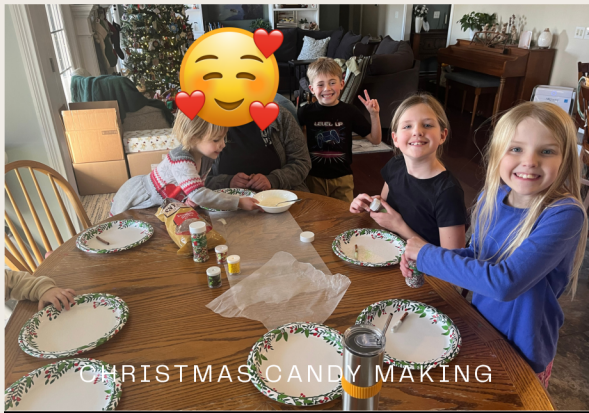
CHRISTMAS CANDY MAKING