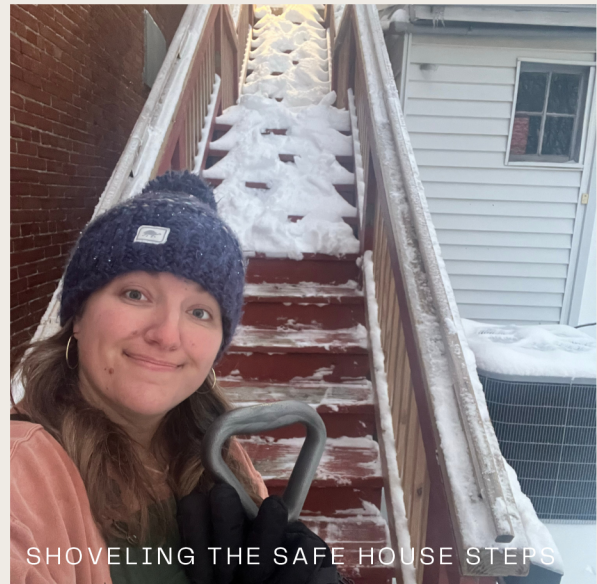
SHOVELING THE SAFE HOUSE STEPS

The holiday season brought a lot of fun and some hard emotions. Two of our ladies made Christmas candy to pass out as gifts this year! Thank you to a dear volunteer who opened her home on Christmas Day and created a safe space for a resident to feel loved.