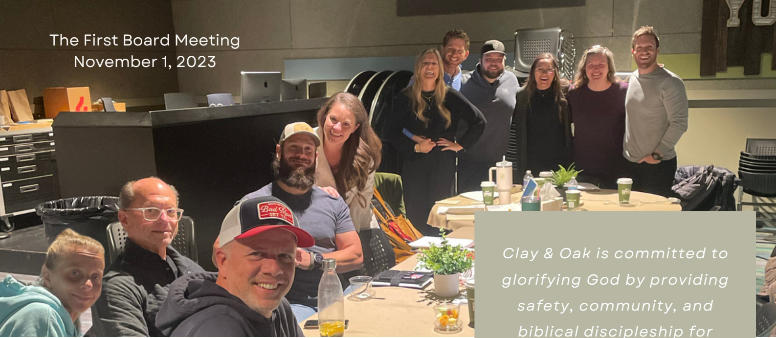
The First Board Meeting November 1, 2023

Clay & Oak is committed to glorifying God by providing safety, community, and biblical discipleship for women who have experienced human trafficking or sexual exploitation.